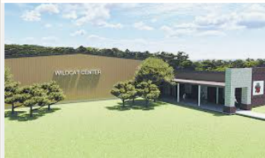
Picture of the new facility.