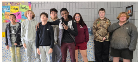
Eighth grade track students pose for a picture.

We look forward to supporting our track team this season and wish them the best of luck!